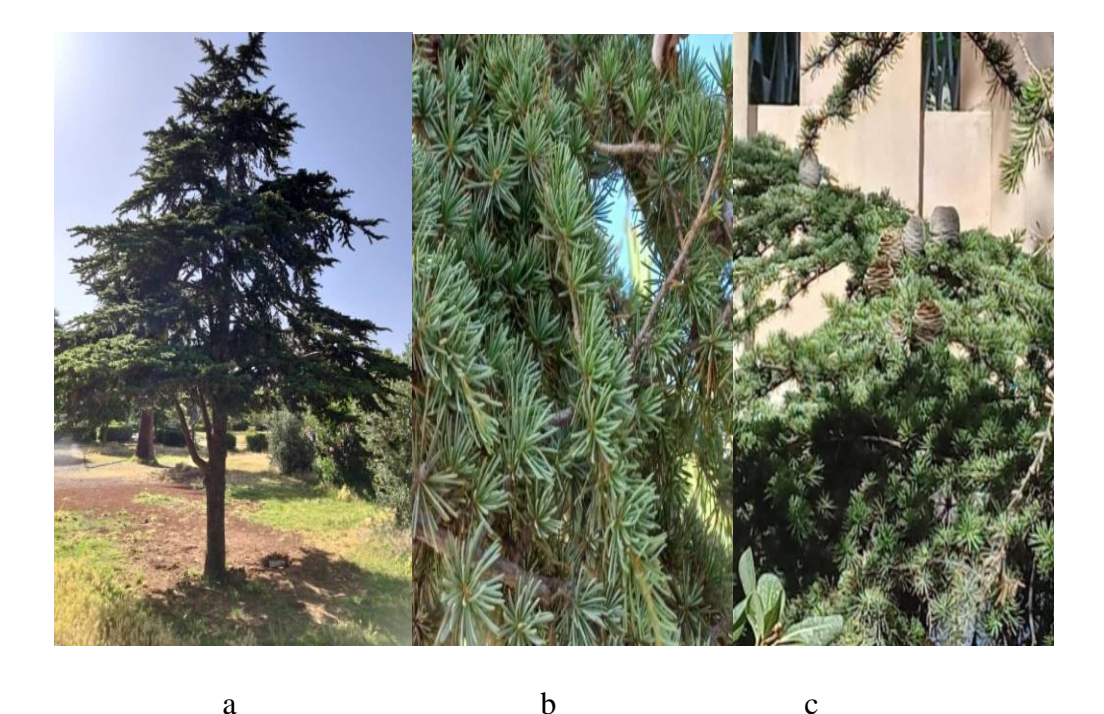
Fig. 1: C. libani A. Rich. tree (a), leaves (b) and cones (c) from Aleppo parks in Aleppo (Syria), where it is planted as an ornamental tree.

The Old Testament of the Holy Bible contains over 75 mentions of C. libani , and the Epic of Gilgamesh, the oldest documented legend, also contains mentions of C. libani <sup>7</sup>. Ancient civilizations made extensive use of this tree to build boats, temples, and palaces<sup>8</sup>. The Egyptians also employed this tree's essential oil during the mummification process<sup>9,11</sup>. It is also employed as a representation of power and stability<sup>12</sup>.